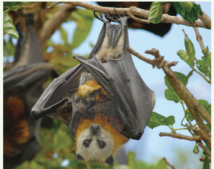
Flying fox mother and baby

Some megabats are called flying foxes because of their fox-like faces and the red-coloured fur on their bodies. Although megabats hunt at night, large groups can often be seen during the day hanging from tall trees.