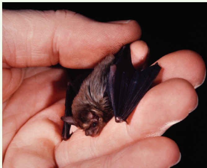
Kitti's hog-nosed bat

Microbats are very small. They are mostly insectivorous, which means their diet consists of flying insects such as beetles, moths and mosquitoes. They usually live beside rivers and creeks, so they have access to fresh water. They also live in parks, reserves and even residential areas. During the day they roost in trees and hollows. They feed at night and although they have good eyesight they use sound waves and echoes to find their prey in the dark. This 'bat sonar' is called echolocation.