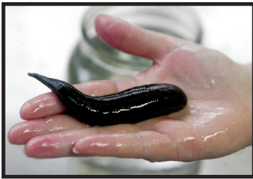
Leech being used for medical purposes

Have you ever had the experience of pulling off your sock to find something thick, black, and shiny clinging to your skin? To make matters worse, it may be fat because it is full of your blood. Your first thought was probably, how do I get this disgusting thing off?