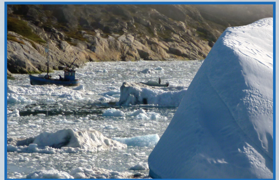
Icebergs and sea ice