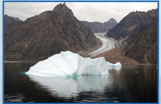
Arctic glacial iceberg

The most famous attribute of an iceberg is its deceptive appearance. Because of the difference in density between fresh water and salt water, only about one-ninth of an iceberg is visible above the waterline. This means that most of its mass is hidden from view. The expression 'tip of the iceberg' is used to describe a problem that is only a small part of a larger challenge.