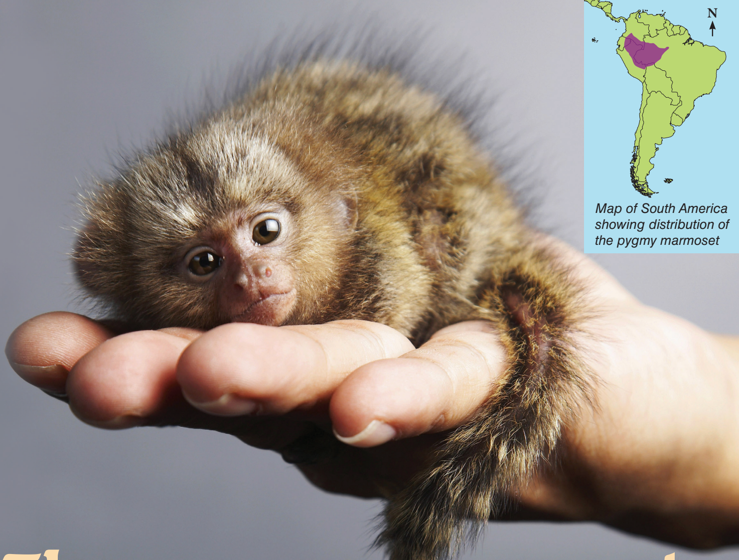
Map of South America showing distribution of the pygmy marmoset